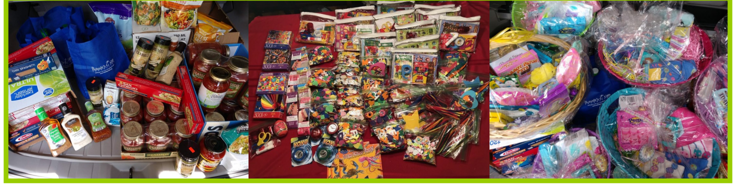
Donations received to benefit our clients during the COVID-19 Pandemic